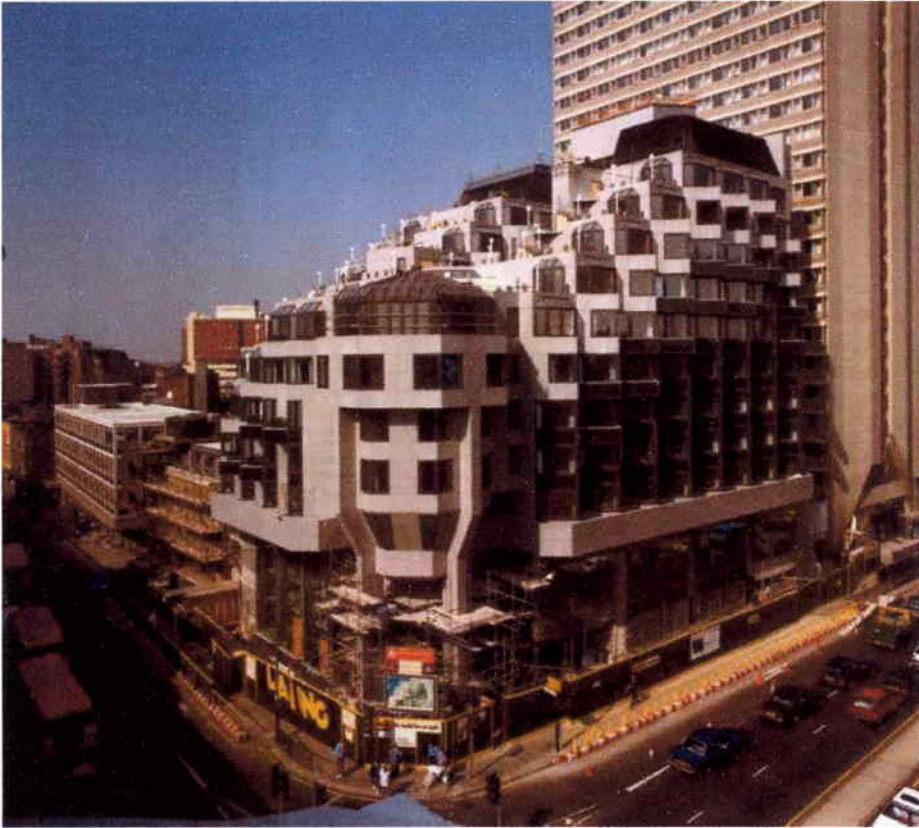
LONDON METROPOLE HOTEL, EDGWARE ROAD LONDON