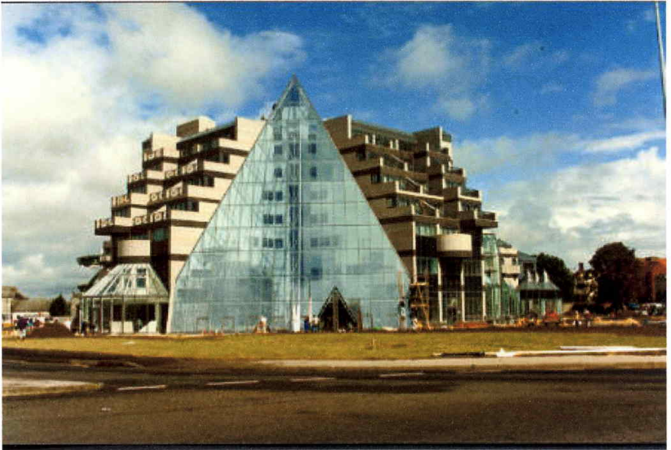
DE VERE GRAND HARBOUR HOTEL, WEST QUAY, SOUTHAMPTON