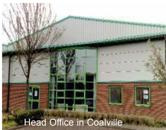
Head Office in Coalville

Take A Step Further with the leaders in prosthetic service.