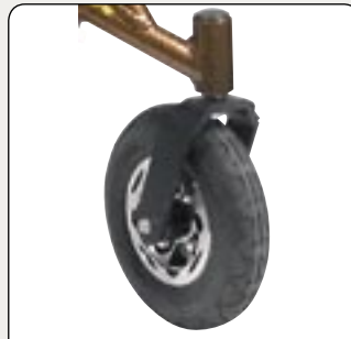
8" x 2" front castors

① 24" or 25" x 2.75" knobby wheels and tyres, ② 8" x 2" front castors, ③ Reinforced front end, ④ Centre-of-gravity adjustment, ⑤ 90° front frame angle, ⑥ Engineered for front and side to side stability.